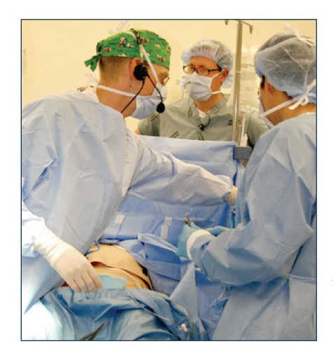
Clinical staff practice operating room skills during a cardiac surgery simulation. The surgeon in this case is played by an experienced cardiac anesthesiologist. The scrub tech and anesthesia professionals are all third year anesthesia residents taking the simulation course.