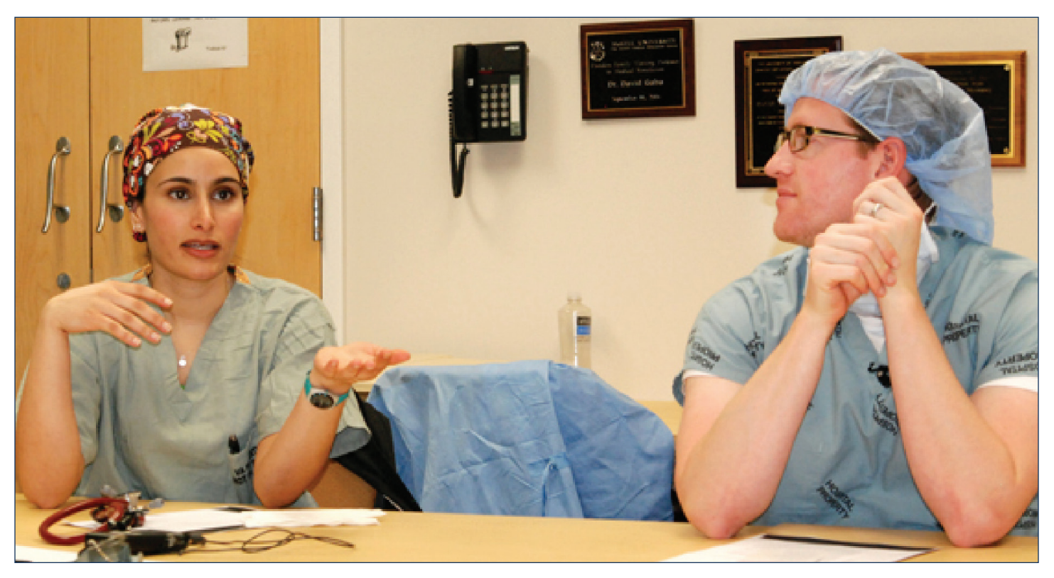
After a simulation scenario is completed, participants debrief with an experienced instructor to discuss any alternative solutions available at various points of the case, along with the pros and cons of those alternatives. Video recordings (not shown in this view) are used as appropriate to generate discussion.