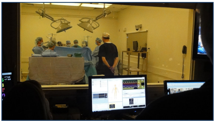
Participants at the Comprehensive Instructor Workshop are observed in a simulated training environment.

like this is sharing experiences with fellow participants and increasing one's network of simulation contacts. My class included civilian and military physicians, nurses and respiratory therapists from all over the United States, Canada and as far away as Singapore and Saudi Arabia.