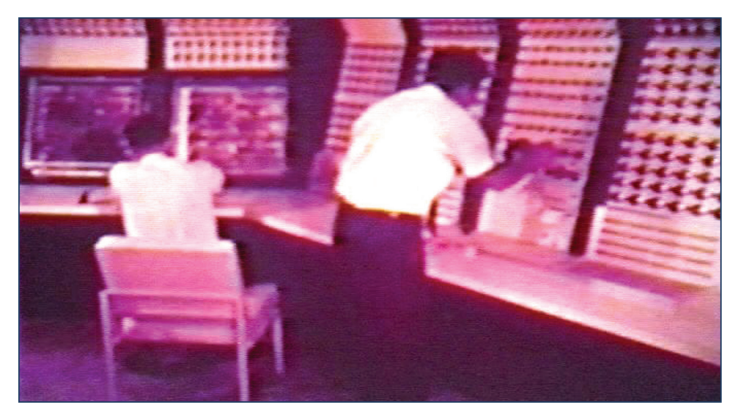
This image and others in the article are screen captures from a video of Sim One, the first computer-controlled patient simulator, available for viewing at www.simlearn.va.gov.