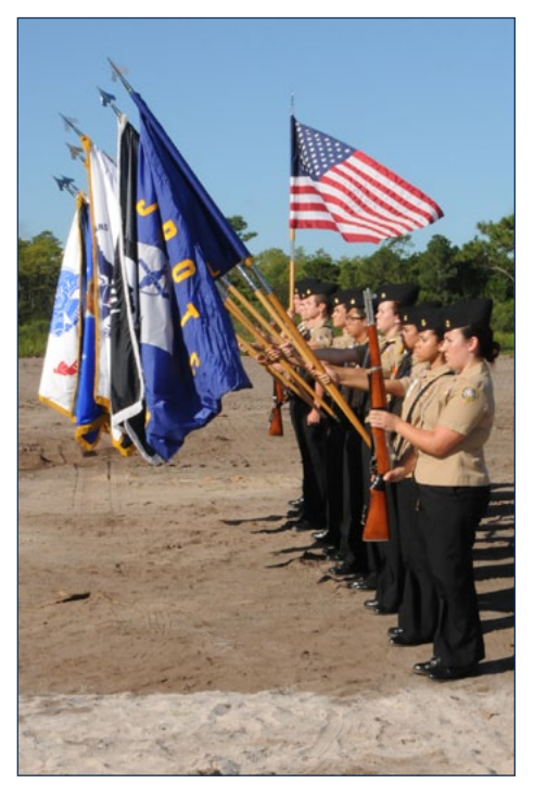
Members of the Navy Junior Reserve Officer Training Corps unit from Winter Park High School present the colors prior to the ceremony.

The new center will serve as the operational hub for coordination of all national VA simulation-based clinical training activities. The facility will provide an immersive training environment by replicating actual patient treatment areas, including an outpatient clinic setting, an inpatient/hospital setting