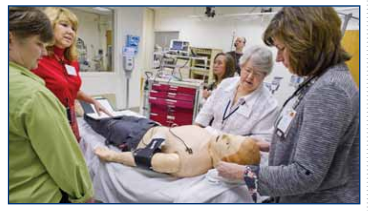
Participants of the SimLEARN Palo Alto Clinical Simulation Instructor Training Course practice a procedure on a mannequin during a simulation exercise in February.

PALO ALTO, CA - Fifty aspiring clinical simulation educators across varied disciplines, such as physicians, nurses and associated health care providers, participated in several SimLEARN Palo Alto Clinical Simulation Instructor Training Courses in February through May. The primary purpose of the training was to help build a cadre of qualified VHA clinicians who can facilitate health care training that makes use of simulation modalities.