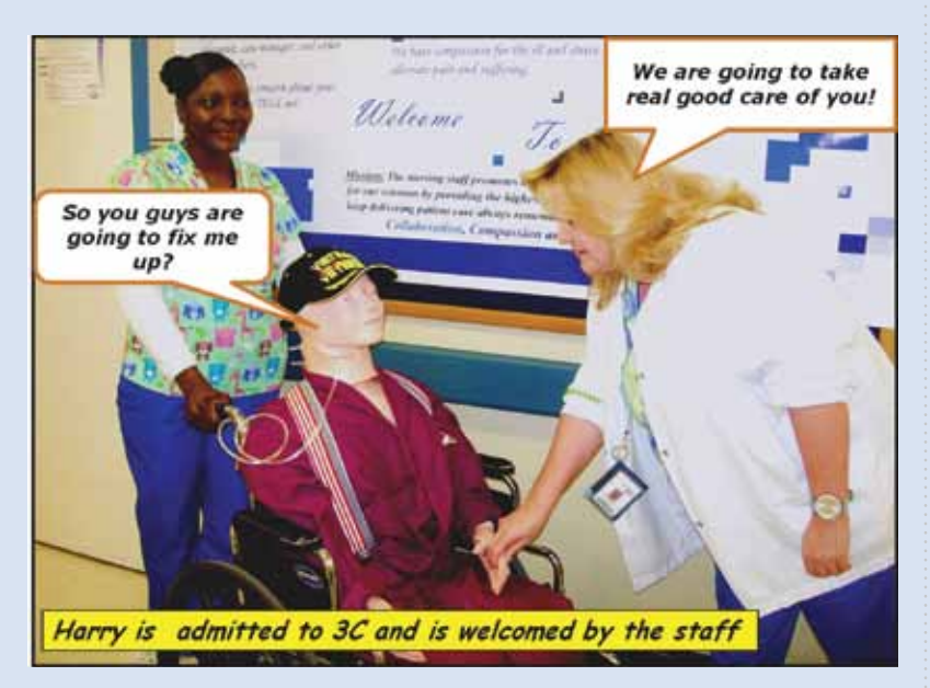
In this image or panel, "Harry" is admitted to the medical center. Illustrations for a booklet series are in the form of panels designed in the style of a comic book to illustrate a variety of medical training scenarios.